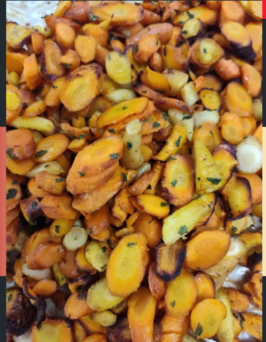
Florence ISD-Common Market